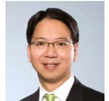
The Hon. Charles MOK, JP Legislative Council Member